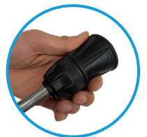
Adjustable Fan Lance