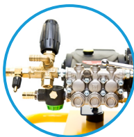
Adjustable Pressure Regulator