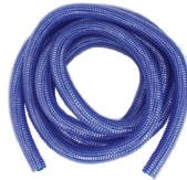
5M 50mm Wire Reinforced Hose