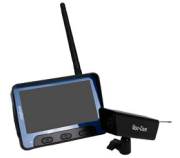
skyVac® 'Real-Time' Inspection System